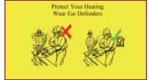
The Trojan Horse message improving safety on site.